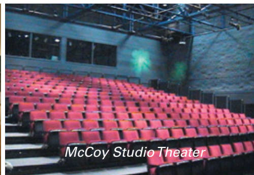
McCoy Studio Theater