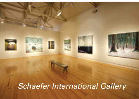
Schaefer International Gallery