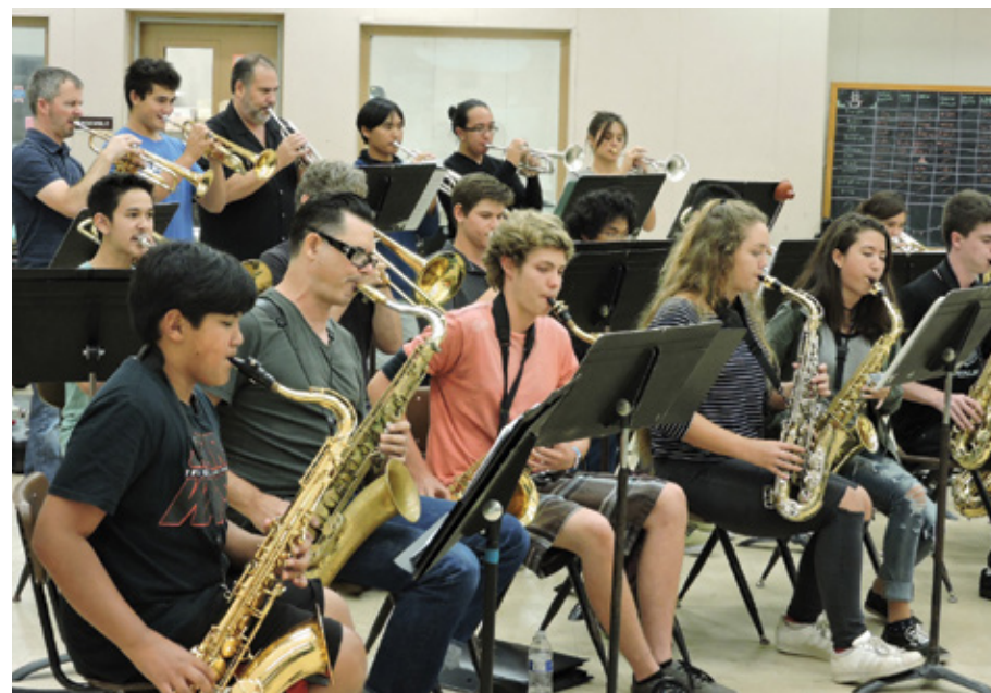
Big Bad Voodoo Daddy band with King Kekaulike High School jazz band