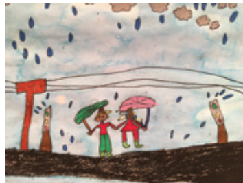
Student work, Young Creatives, 2016

We welcome back the Art Maui organization to present their 40 th annual juried exhibit. This annual exhibition features talent from Maui's community of artists in a variety of media including drawing, painting, printmaking, photography, jewelry, fiber, video, and sculpture.