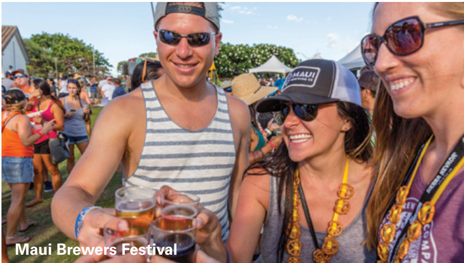
Maui Brewers Festival