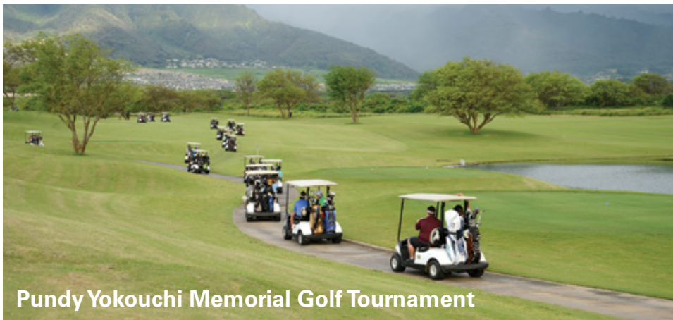
Pundy Yokouchi Memorial Golf Tournament