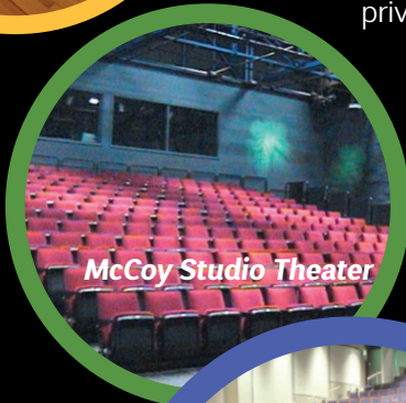
McCoy Studio Theater