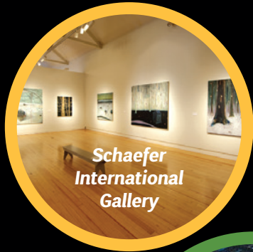
Schaefer International Gallery

Please remember shows and events are subject to change or cancellation with little or no advance notice. For up-to-date calendar information, check the MACC website at MauiArts.org