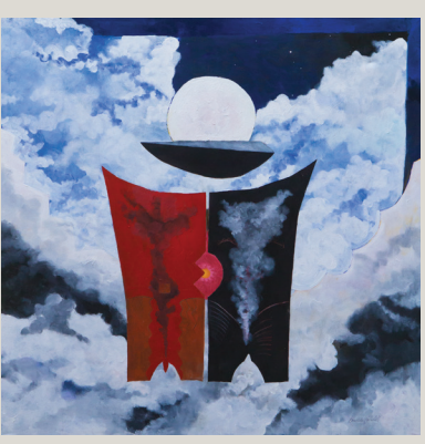
Imaikalani Kalahele Papa lāʻua ʻo Wakea, 2017 acrylic on canvas