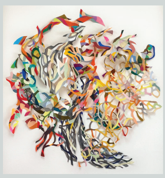
Holly Wong Arachne 1, 2020 colored pencil, graphite on woven drafting film