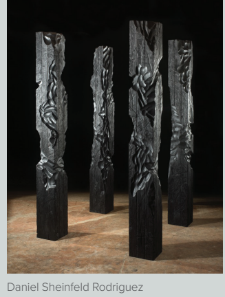
Obsidians, 2021 charred Douglas fir, wood stain

For information on exhibitrelated public programs, please see our website mauiarts.org